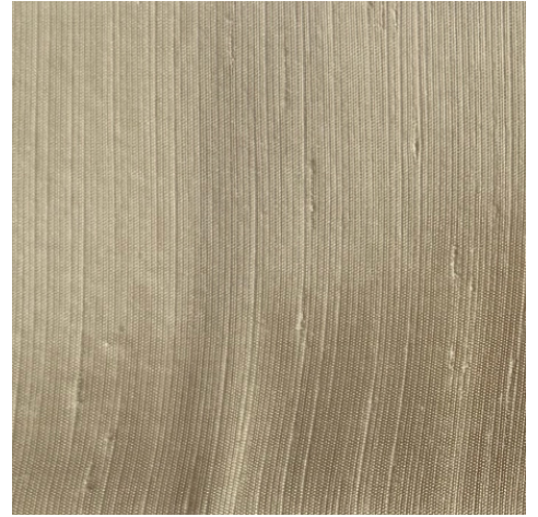
CHAVIÈRES - POLYESTER - DESIGNERS GUILD The full range of colors is available Fire-retardant treated fabric