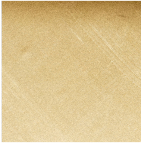
CHINON II - RAW SILK - DESIGNERS GUILD The full range of colors is available