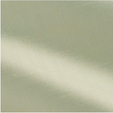
SARI - RAW SILK - PIERRE FREY The full range of colors is available